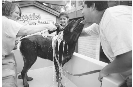
Bruin, an 8-year-old Rottweiler, gets a bath at the new Wripples PetSpa on Saturday at Lookout Park in Summerland. C.A.R.E.4Paws hosted a dog wash to help raise funds for its educational programs.

For more information about the organization, call 968-2273, e-mail info@care4paws.org or go to care4paws.org .