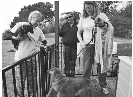
Squeaky clean! Sure, some of them may squeak a bit, but they get clean. Four-legged Fidos and their owners line up for the benefit dog wash on Saturday.