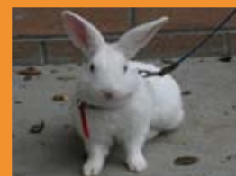
Cute comedian Ferguson from Santa Maria Animal Center.