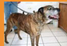
Loving and loyal Buster from VIVA.

Contact us for more details about these great pets.