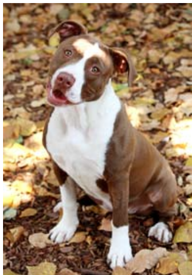
Our next Project ResponsiBull workshop is scheduled for January 15 at CAPA in Lompoc. Contact us for more details.

The pit bull, more than any other breed in history, is continuously made a villain through media hypes and irresponsible ownership. It's the number-one bred dog in the United States, and the breed that gets euthanized the most and adopted last in shelters. This is why we started Project ResponsiBull, a three-part program for owners of pit bulls and pit mixes that includes free obedience training, breed education and a free spay/neuter. We teach participants about the pit bull's history, how it got its bad rap, common characteristics, myths, and how to deal with some of the most typical behavioral problems. Our goal is to increase retention and inspire an ever-growing number of pit bull ambassadors