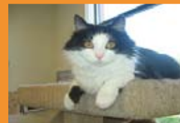
Fun and feisty Ritter from ResQcats.

Looking to bring home a four-legged family member? Check out C.A.R.E.4Paws' Top Dogs, Cool Cats & Brilliant Bunnies, a wonderful selection of shelter and rescue pets for adoption. Care4paws.org offers a complete list of pet profiles.