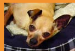
Cuddle-bug Polo from Santa Barbara Humane Society.