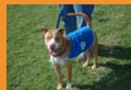
Lovable and handsome Hondo from K-9 PALS.